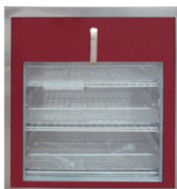
Toughened glass door