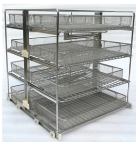
Standard cleaning rack

Pre-cleaning → Clean with enzymes → Rinse → Thermal disinfection → Glazing clean → Drying